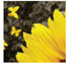
raster art - zoomed in

We cannot use raster art for making custom chocolate.